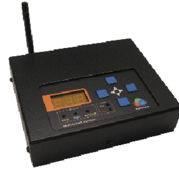
DMX-Link Wireless DMX Interface User's Manual