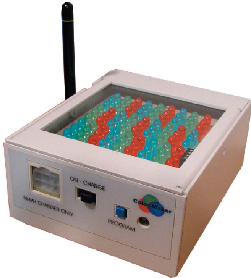
DL75 User's Manual